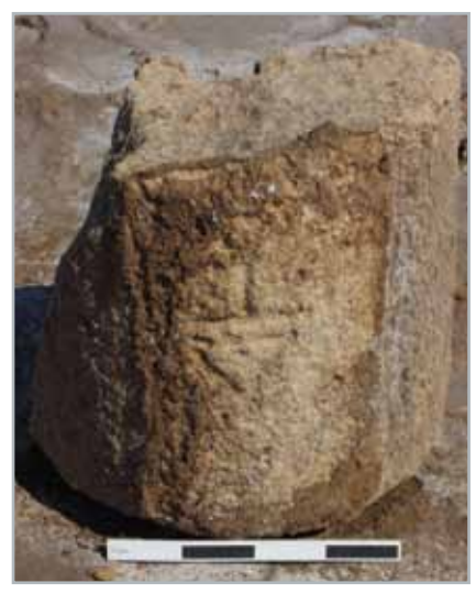
Column with mason's mark (Scale 20 cm).

In our evaluation trench along the city grid, we were surprised to find nearly a dozen whole vessels, all of them large. Seven inverted storage jars were set