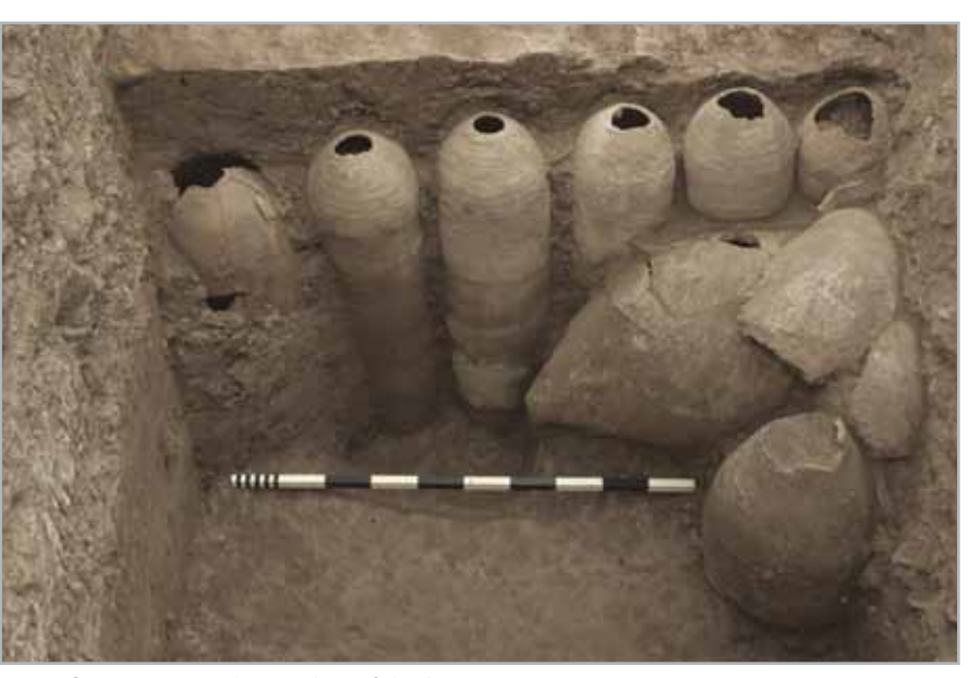
Row of storage jars along edge of ditch.

The ditch beside which these vessels were all found had been used, as ditches often are, as a disposal area for broken crockery and general rubbish, including large quantities of bones, mainly of young sheep and goats, demonstrating that nearby householders ate well.